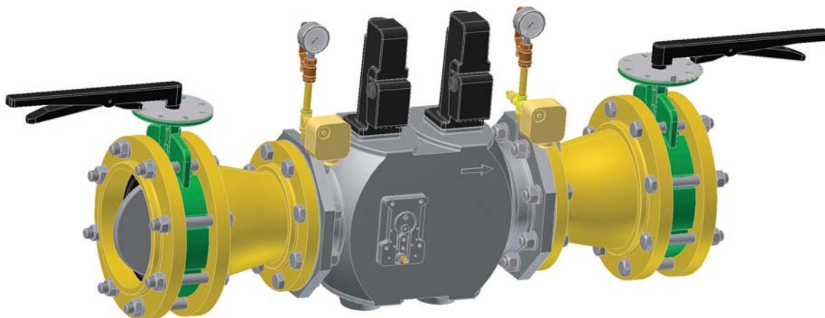
8 Inch CE Valve Train Segment